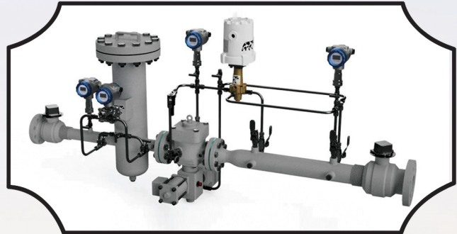
IBR APPROVED STEAM HEADERS AND PRS STATIONS.