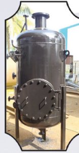
DE-AERATOR TANKS, BLOWDOWN TANKS AND STEAM DRUMS.