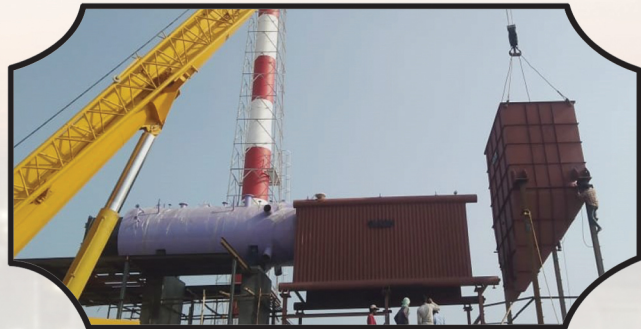
BOILER FUEL BUNKERS, DUCTING AND OTHER BALANCE OF PLANT MANUFACTURERS.